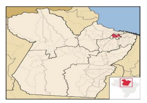
Fig. 1. Metropolitan region of Belém, Pará State, Brazil

It is observed that most of the deaths were male (57.30%; 746/1,302), in the age group over 60 years (80.80%; 1,053/1,302).