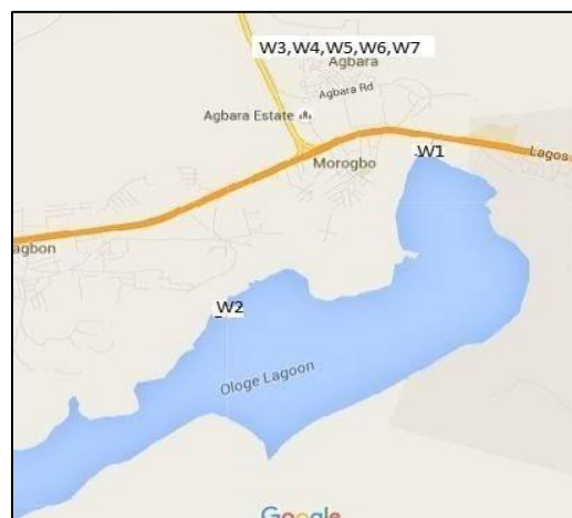
Fig. 2. Ologe Lagoon[15]