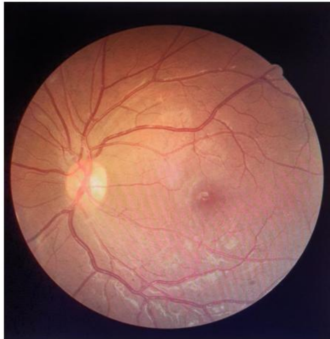
Fig. 2. Left eye with regular optic disc, cup/disc ratio physiological, vessels without alterations, without tortuosities, macula with preserved foveolar brightness