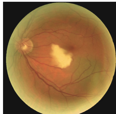
FIGURE 2: Fundus photograph of the left eye branch retinal artery occlusion (BRAO) showing white pallor at the inferior temporal branch of the central retinal artery.

Twenty-four hours after PCI, the patient reported the onset of a left central scotoma and an ophthalmological evaluation was requested. The left visual acuity was reduced to 0.7 logMAR with a central scotoma. There was no alteration in the anterior segment. Intraocular pressure (IOP) was 10 mmHg. Fundus examination revealed a white embolus in the temporal branch of the central retinal artery (Figure 2). A computerized visual field (Humphrey II 740 Visual Field, Carl Zeiss Meditec AG, Jena, Germany) revealed a paracentral visual defect (Figure 3(a)). Moreover,