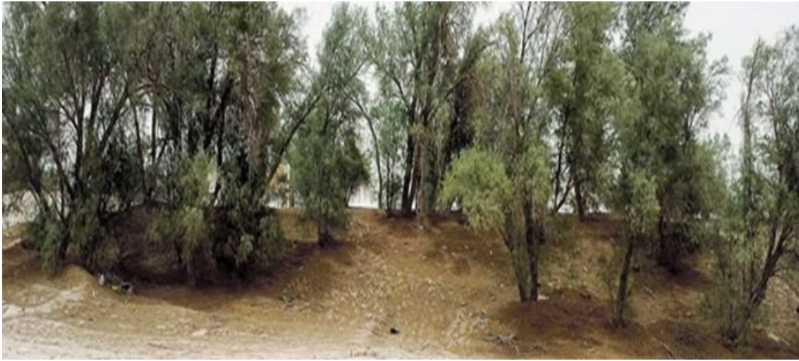
Fig. 3. Casuarina spp windbreak project to stop sand encroachment in Al-Ahsa region, Saudi Arabia