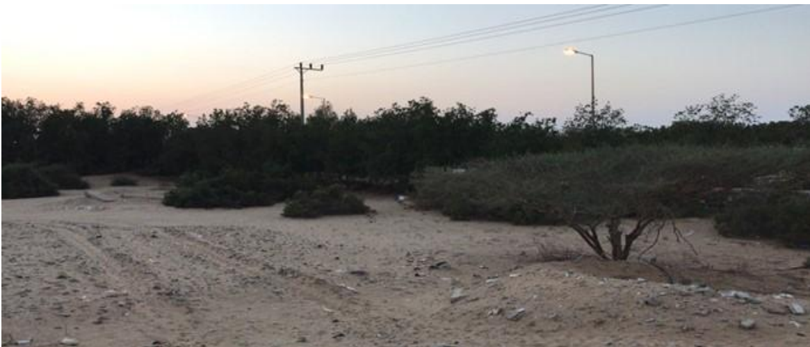
Fig. 4. Conocarpus spp. and Acacia spp. windbreak project to stop sand encroachment in Al-Qunfudhah Governorate, Saudi Arabia