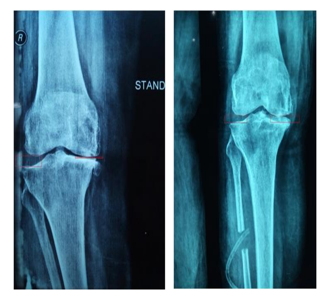
Fig. 1. A plain standing knee AP. Radiographs shows pre and post PFO medial and lateral knee joint space width with obvious opening of the medial joint space and narrowing of the lateral joint space

PFO surgery is less complicated, safer, faster, and more affordable than TKA or HTO, and it doesn't include the placement of implants. PFO is a reasonable surgical choice as a result in the majority of developing nations like Egypt that have inadequate financial and medical resources.