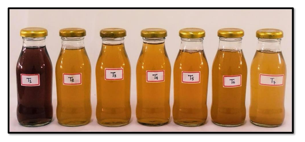
Plate 1. Herbal tea prepared from different blends of rose

plant [19]. These results are in accordance with research findings of Amol et al. [6] who reported that decrease in the antioxidative property during storage period may be due to degradation in anthocyanin, total phenols, change in the pH composition, which are responsible for stability of antioxidant properties. Similar results were reported by Naithani et al. [20] and Ramya et al. [17].