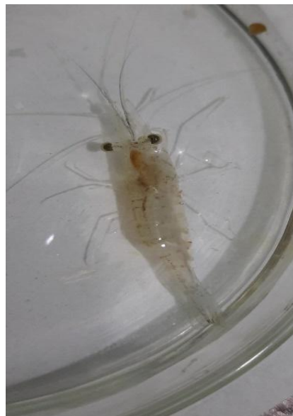
Fig. 2. Freshwater prawn, M. lamarrei .

The parameters a and b were evaluated by linear regression [38,39,40,41,9]. This equation is sometimes also referred to as the length-weight key [42].