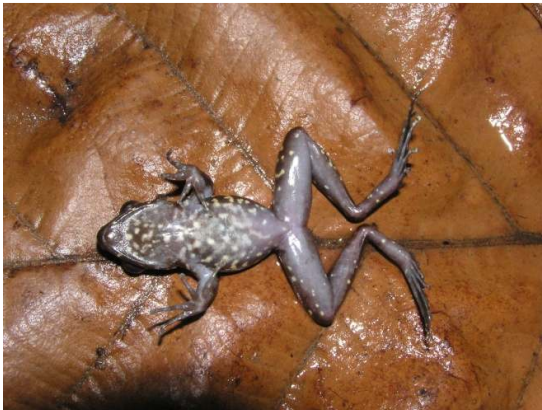
Fig. 3. Death feigning behaviour displayed by H. picturata

Beside thanatosis, this specimen also showed a body raising behaviour (Fig. 6), and several characteristics were documented: body elevated approximately 45°, snout facing up, forelimbs erected in straight position, palmar surfaces touching the substrates, hindlimbs expanding out laterally, hindlimbs not meeting substrates except for the plantar surfaces, and inguinal area raised-up. This type of behaviour was displayed by the frog after gently hitting it with a blunt forcep. It retained in this position for about 2 minutes before leaped again.