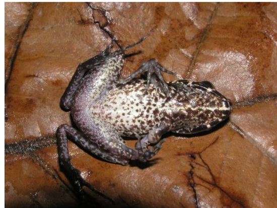
Fig. 5. Death feigning behaviour exhibited by H. laterimaculata

The third species, a male O. laevis (SVL=34 mm, HW=7 mm, W=1 g) (Fig. 7) was observed near a small temporary puddle, beside the roadside, along the way to Ulu Paip. While trying to capture it, the frog made a single jump and hiding beneath dead leaves. After the leaves were removed, surprisingly the frog did not leap but turned their body upside down displaying death feigning posture (Fig. 8). While in this position several characteristics were recorded: ventral surface turned up, exposed yellow-grey throat, showed yellow-white belly, both eyes partially opened, forelimbs raised upward, exposed palmar surfaces, right hindlimb held close to body, left hindlimb stretched out, and displayed plantar surfaces. The frog was in this stationary position for approximately 2.5 minutes before resuming normal posture and leaping away.