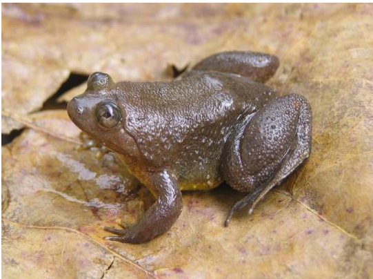
Fig. 7. An adult O. laevis from Ulu Paip, Kedah