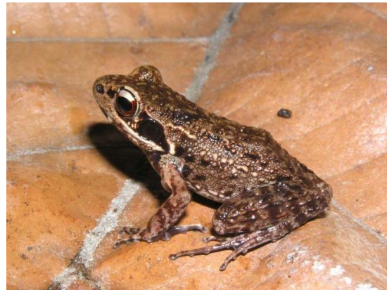
Fig. 4. An adult H. laterimaculata from Sungai Sedim, Kedah

Beside thanatosis, this specimen also showed a body raising behaviour (Fig. 6), and several characteristics were documented: body elevated approximately 45°, snout facing up, forelimbs erected in straight position, palmar surfaces touching the substrates, hindlimbs expanding out laterally, hindlimbs not meeting substrates except for the plantar surfaces, and inguinal area raised-up. This type of behaviour was displayed by the frog after gently hitting it with a blunt forcep. It retained in this position for about 2 minutes before leaped again.