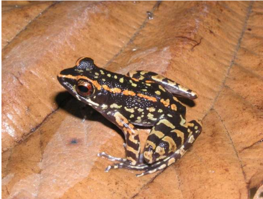
Fig. 2. An adult H. picturata from Sungai Sedim, Kedah

exposed granular glands on thigh surfaces, and apparent plantar surfaces. Within this period, no odorous or distress calls were emitted by the frog. One and a half minutes later, the frog returned to normal posture and leaped again.