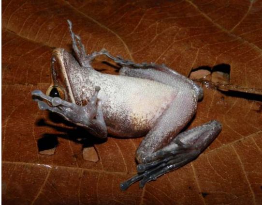
Fig. 10. Thanatosis posture (head flexed ventrally) exhibited by P. leucomystax

in this motionless position for nearly three minutes. In addition, this specimen also emitted a distress call when we grasped it very tightly, but no recording was made. Table 1 summarizes the defensive behaviours displayed by all the observed specimens.