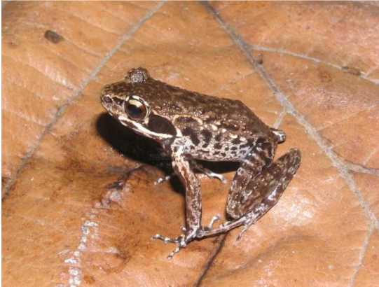
Fig. 6. Body raising behaviour showed by H. laterimaculata