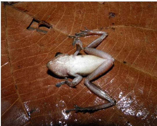
Fig. 11. Thanatosis posture (hindlimbs laterally stretched out) exhibited by P. leucomystax