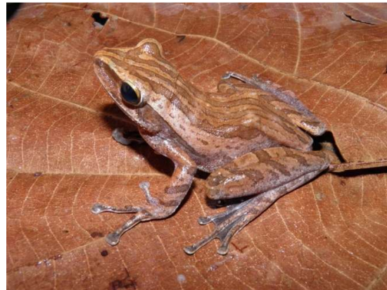
Fig. 9. An adult P. leucomystax from Bukit Hijau, Kedah

above ground) near an artificial fish pond at Bukit Hijau, Kedah. The air temperature and humidity values of the site were 24°C and 68%, respectively. Upon capture, the specimen was actively calling, and another two individuals were also observed nearby. The captured tree frog was brought to the laboratory for further inspections. When approached for photography, the specimen fled by leaping in various directions for approximately 10 minutes. After recaptured and placed it on leaves, the specimen rapidly turned its ventral surface up, showing thanatosis behaviour. However, their body posture was slightly different, as the frog arched its head ventrally (Fig. 10). Several other characteristics were also recognized: Body upside down, exposed dark brown throat, displayed whitish belly, body slightly arched up, head facing up (approx. 45°), both eyes fully opened, forelimbs raised upward and showed palmar surfaces, hindlimbs adpressed to the body, displayed plantar surfaces and webbing. The specimen was in this immobilized position for about three minutes before returning to normal posture.