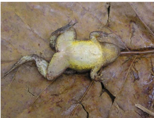
Fig. 8. Thanatosis behaviour displayed by O. laevis

Finally, a male P. leucomystax (SVL=50 mm, HW=17 mm, W=9 g) (Fig. 9) was captured, perched on leaves of low vegetation (< 1 m