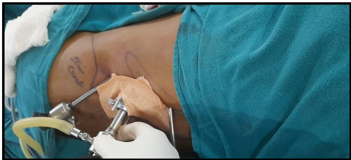
Fig. 2. Use of hasson cannula in 10 mm port and use of dynaplast after suturing to prevent air leakage