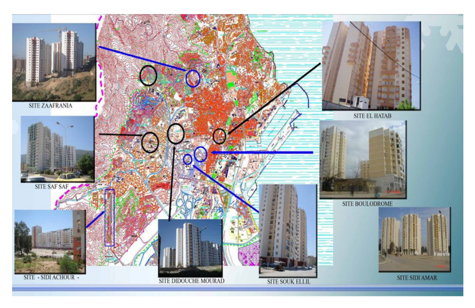
Figure 3. Location of accommodation sales (Rent -sale) in the Greater Annaba

Projects that involved real estate development in the five-year program represent 11% of total housing part. Although, the rate of participation in solving the housing crisis is low, this formula reflects a quality of production by compared to other forms, through our air forceall programs of the study of real estate development were part of the commute Annaba, in coastal sites exposed to the rental period in the summer (see Figure 3).