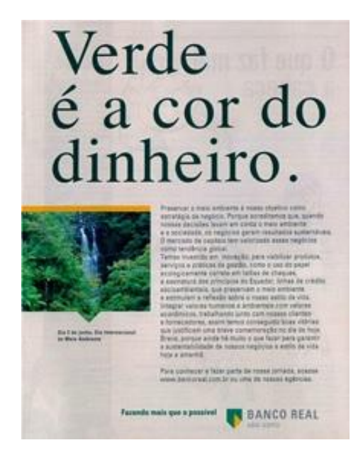
Fig. 1. Banco Real Ad in the Magazine See edition of June 07, 2006, page 14

Source: Authors' adaptation from the data collected in documentary research Veja magazine between 2004 and 2014.