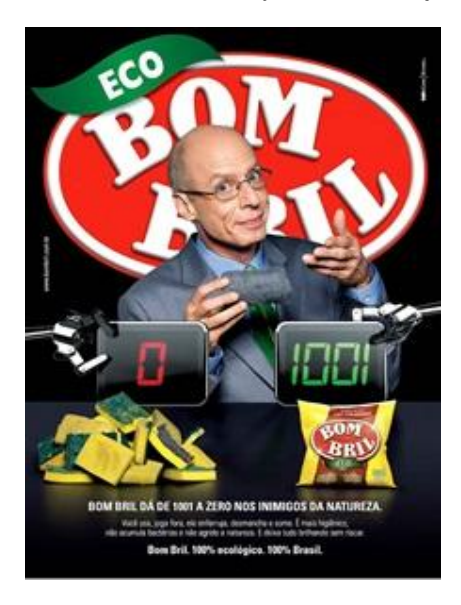
Fig. 2. Bombril Ad in Veja magazine edition of May 19, 2010, page 93 Source: Digital Archive Veja magazine, in 2018.

Source: Authors' production from the data collected in the documentary research of Veja magazine between the years 2004 and 2014.