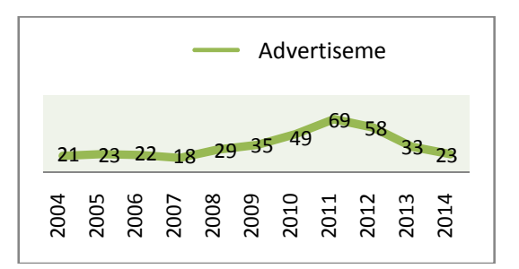
Chart 1 - Curve of ads classified as "environmental" in Veja magazine between the years 2004 and 2014

Definition: In this category, the brand is positioned as owner of what will be best for the question of the nature under the aegis of Liquid Modernity [3] [2] [4]. Brings speeches loaded with emotion that self-promotion as the great protectors of the environmental cause.