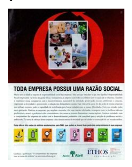
Fig. 4. Ad Ethos Institute in Veja magazine edition of October 20, 2004, page 131

veracity of the information passed by the manufacturers, bringing the announced message through a critical-reflexive bias.