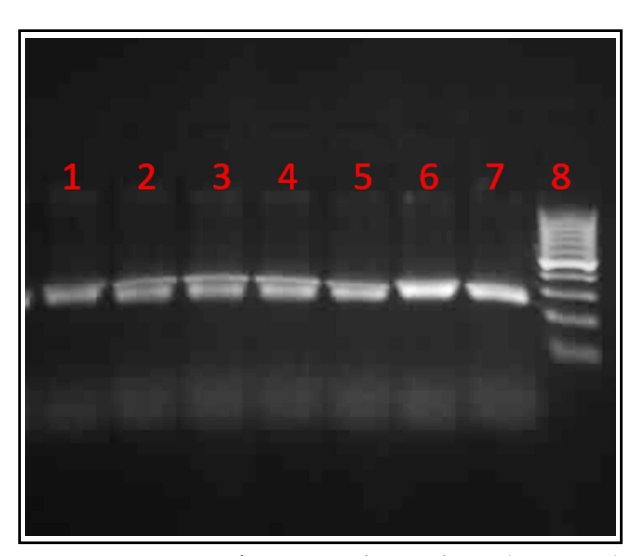
Fig.2: Genotyping of exon 7 polymorphism (rs1801725) in CASR gene. This gel represents the PCR products after digesting with Hin1I enzyme. Lanes (1-5) showed heterozygous genotypes with three bands of sizes (28, 241, and 269 bp). Lane 6 showed homozygous genotype with one band of size (269 bp). Lane 8 represents the DNA ladder (100 bp).