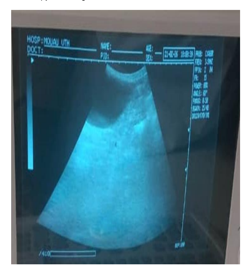
Fig. 1. Ultrasonography of pseudopregnant uterus of the bitch

of bromocriptine and carbergolin administered in high doses [25,26]. In bitches with repeated cases and not intended for breeding, ovariectomy or spaying, preferably done during anestrus phase is the only permanent solution [27,19]. Cases of false or pseudopregnancy are present in all breeds of dogs and has huge socio economic impacts on dog breeders and owners.