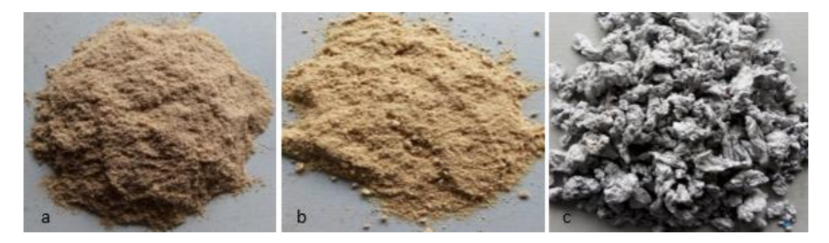
Fig. 1. Dry forms of (a) untreated wood dust (b) treated wood dust (c) waste newspaper pulp

Again, the procedure used by Oladele and Okoro [11] was adopted to assess the percentage water absorption of each sample after immersion in water for 6 hours. All the tests in this work were performed at room temperature. In each case, the mean and standard error values of the results were computed, tabulated and analyzed.