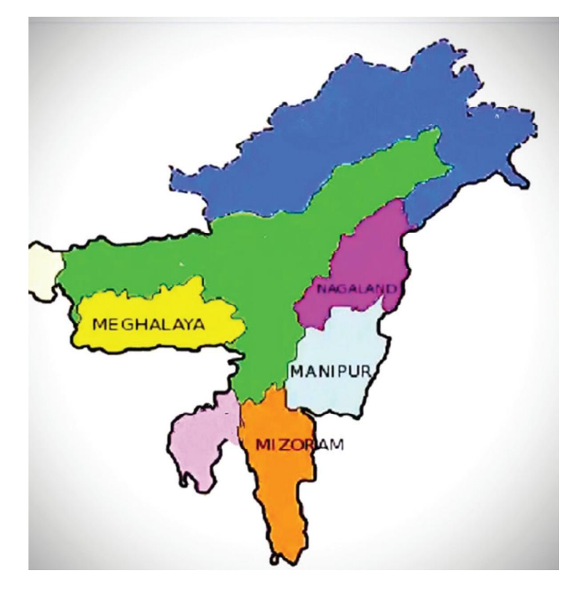
Fig. 1. A map representing the four Northeast states of India in which representative sampling were collected for the study.

All the 1286 E. coli isolates were subjected to antimicrobial susceptibility test against 15 selected antimicrobial agents. All of them including atypical EPEC and STEC showed resistance to at least three antimicrobials of which, cefalexin (78.69%) exhibited highest level of resistance followed by amoxycillin (77.13%), ampicillin (72.31%), enrofloxacin (60.73%), piperacillin (50.46%), nalidixic acid (29.70%), cefixime (16.32%), gentamicin (11.97%),ceftazidime (11.50%), aztreonam (11.50%), cefotaxime (9.25%), streptomycin (8.94%), ciprofloxacin (8.39%), ceftriaxone (8.32%) and imipenem (0.15%). Converselv. higher susceptibility of the isolates was recorded against imipenem (99.84%) followed by ceftriaxone (91.67%), ciprofloxacin (91.60%), streptomycin (91.05%), cefotaxime (90.74%), aztreonam (88.49%) and ceftazidime (88.49%).