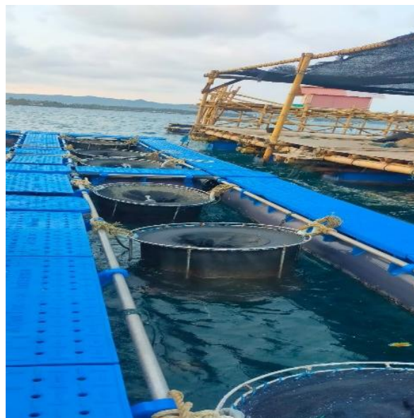
Fig. 2. Lobster culture cage during the research

Information: G = Daily growth rate (%) W t = average seed weight at the end of the study (g) W 0 = average seed weight at the start of the study (g) t = Fish rearing time (days)