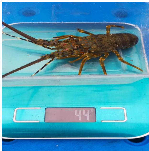
Fig. 1. Spiny Lobster ( Panulirus homarus )

Data were analyzed descriptively. Then the effect of each treatment was tested by analysis of variance (ANOVA) F test at a 5% test interval, if there was a significant difference it was continued with Duncan's multiple range test.