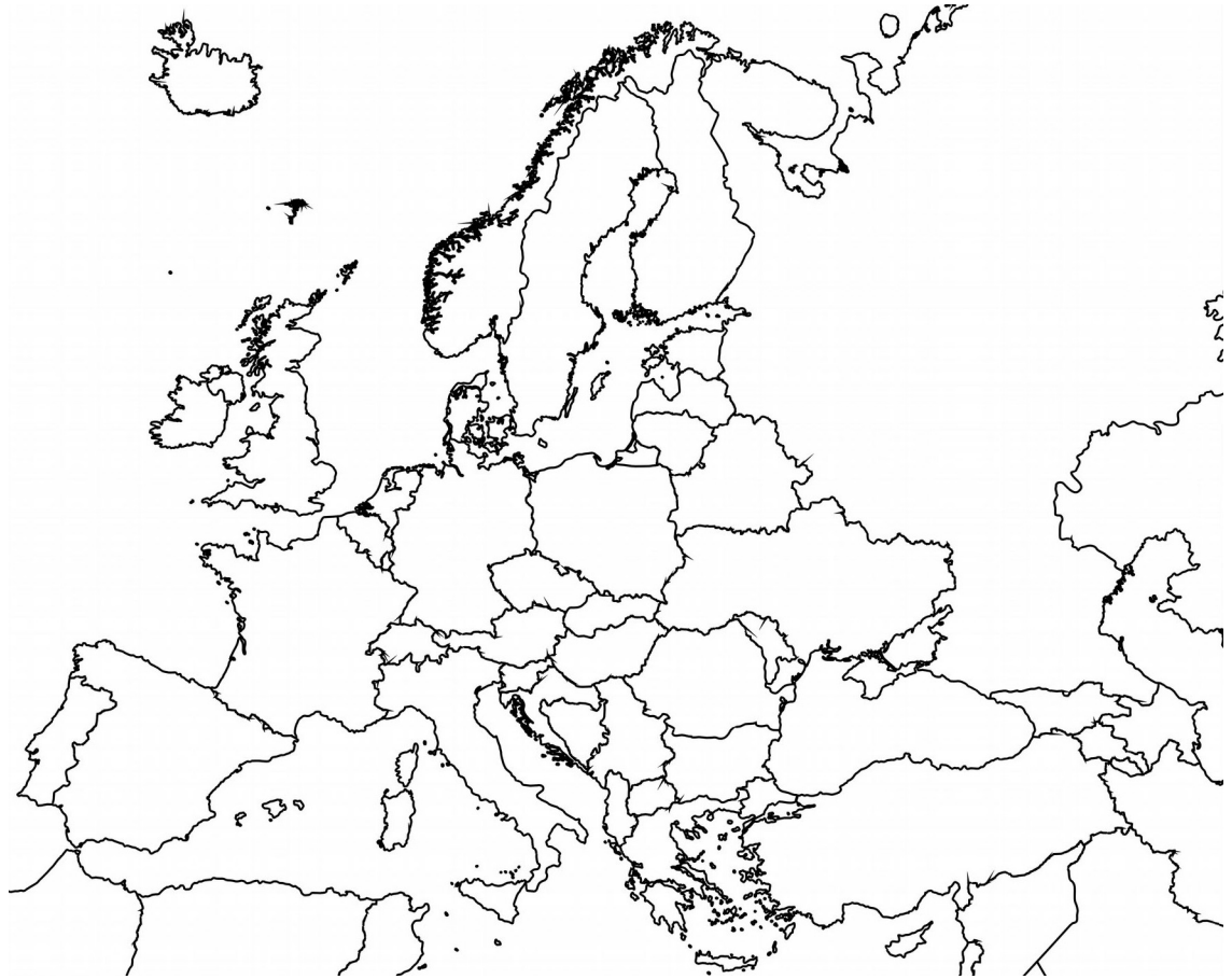
Fig 1. Map of Europe included in the questionnaire. The map was prepared using political boundaries from the dataset of thematicmapping.org .

https://doi.org/10.1371/journal.pone.0260848.g001