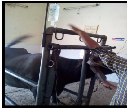
Fig. 9. Buffalo was pre-medicated treatment