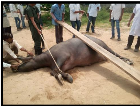
Fig. 7. Placing the plank over the abdomen