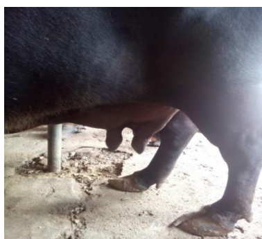
Fig. 3. Mammary glands fully engorged with milk