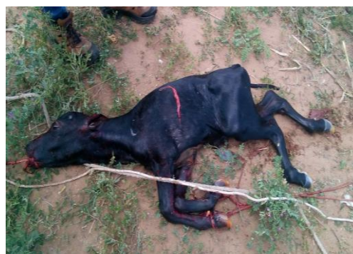
Fig. 12. Delivered large size male fetus