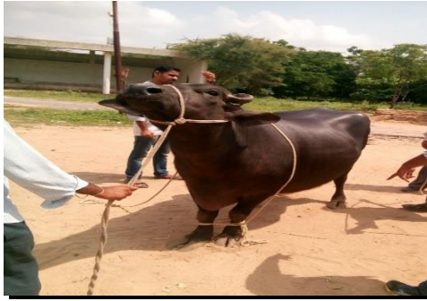
Fig. 5. Restraining the buffalo by holding fore limbs and hind limbs of buffalo