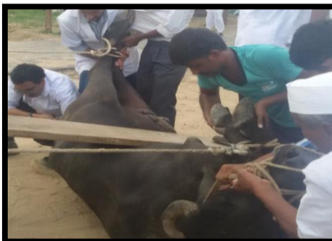
Fig. 8. Rotation of animal in clock wise direction