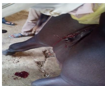
Fig. 4. Dark reddish bloody discharge come out from vagina and twisted valva toward right side