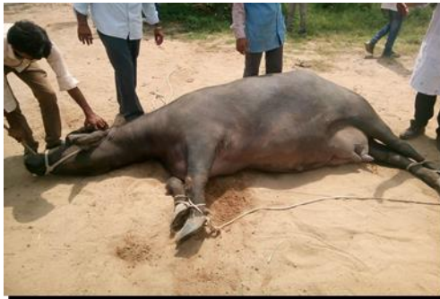
Fig. 6. Restraining the buffalo in right lateral recumbency