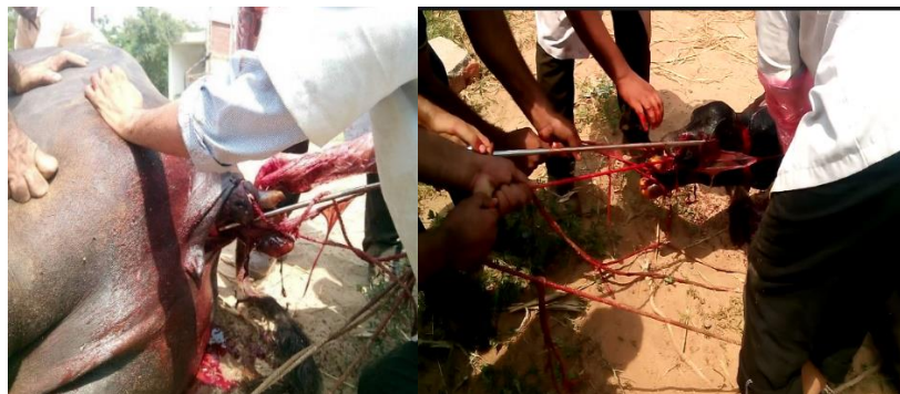
Fig. 11. Vaginal delivery of dead fetus by Equal force extraction should be applied to each rope and obstetrical hooks on forelimbs & head from birth canal of dam