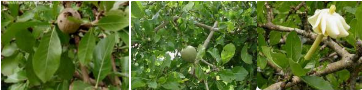
Gardenia ternifolia Schum.&Thonn.