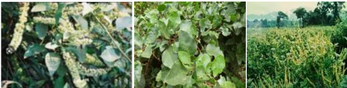
Phytolaca dodecandra L Herit

© 2023 Bwogo and Masai; This is an Open Access article distributed under the terms of the Creative Commons Attribution License ( http://creativecommons.org/licenses/by/4.0 ), which permits unrestricted use, distribution, and reproduction in any medium, provided the original work is properly cited.