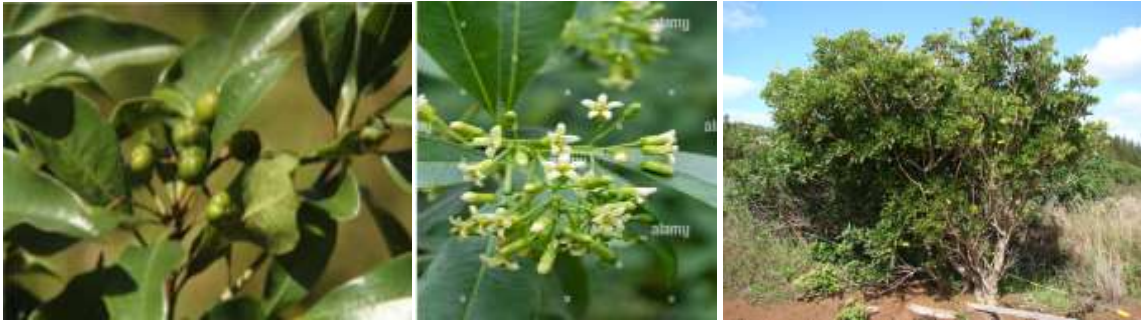
Pittosporum viridiflorum Sims. var. viridiflorum (S.L)