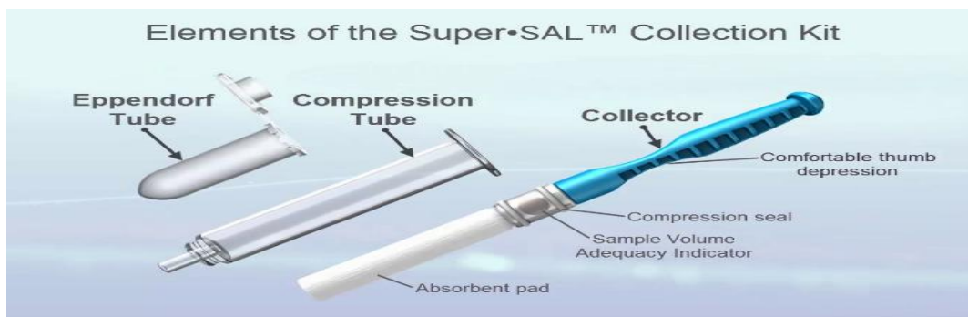
Fig. 2. Components of super•SAL device [11]