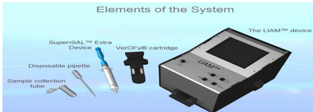
Fig. 1. Elements of LIAM device [11]

ELISA has a higher turnaround time as compared to LFIA because of the lengthy procedure as the sample requires further preparation these significantly adds the turnaround time to days and weeks between the receipt of the sample and returning of the results. Whereas with LFIA it is much faster, the result is available within minutes on the spot.