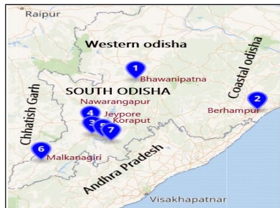
Fig. 1. The study area (south Odisha) where solar on farm activities targeted

South Odisha geology and topography are basically comprises of hills, and rocks of Eastern Ghats belts (EGB) with scanty and uneven rainfall, Agri- Odisha Report, [14], Das et al. [15]. The rain fed areas are absence of irrigation, and the agricultural farmers face huddles of poor yield during both Khariff and Rabi season. In the view of providing round the year irrigation facility to the people, facilitating institution, financing institution, manufacturer, and agency for implementation have joined their hands to design and develop low cost, solar operative irrigation gadgets mounted over bi-cycle for easy use by the rural farmers. The case has been discussed and actors and factors have been identified in the subsequent sections.