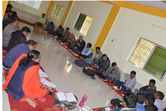
Fig. 2. A meeting of the Harsha trusts in their meeting hall at Jeypore

The cycle mounted solar operated irrigation system employs two solar photo-voltaic (SPV) panels that produces 175W at about 4.1A current. The arrangement was attached to an open dug well, with a tank above the ground for storing water. The SPV panels were based tightly on the carrier of the bicycle for informal movement within various fields intended for irrigation. The arrangement is best suited for irrigating small segment of horticulture land, for the member farmers of PACS. The cost of such an irrigation architecture costs only 25000INR per one unit (Fig. 3).