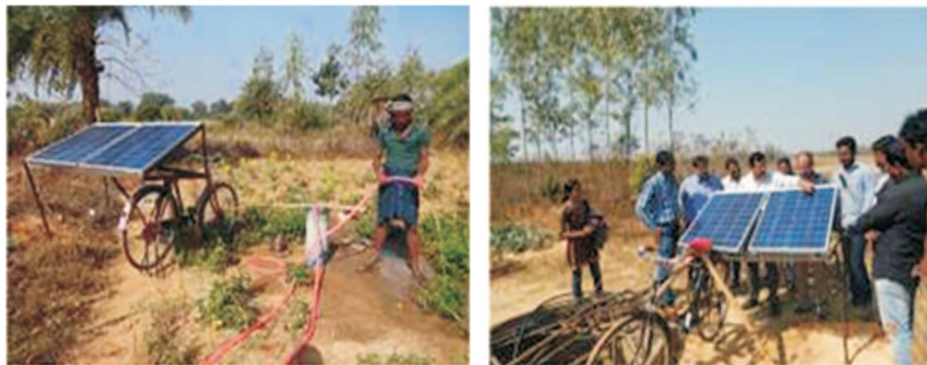
Fig. 3. Solar Energy operated DC Pump for irrigation adopted by Harsha trust