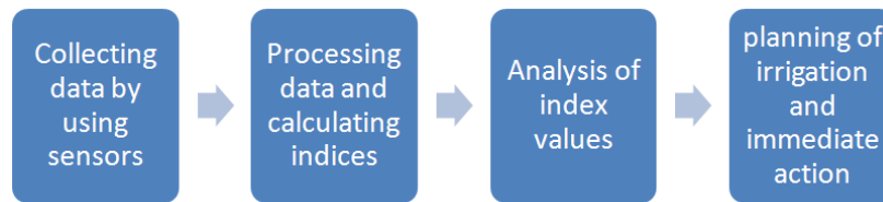
Fig. 2. Series of collection and analysis of data