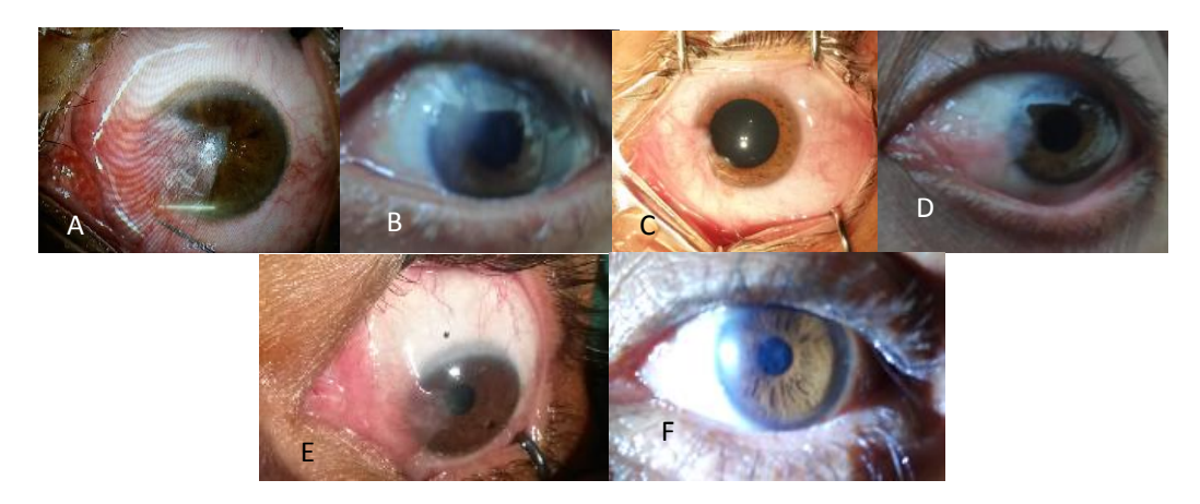
Fig. 2. Images(A, B) for case 1 image A preoperative B postoperative after 12 months follow-ups, image (C, D) for case 2 image C preoperative D postoperative after 12 months follow-ups, image (E, F) for case 3 image E preoperative F postoperative after 12 months follow-ups

Fig. 2 shows images of 3 cases (case1 and 3 had no recurrence, while case 2 had a recurrence of the pterygium)