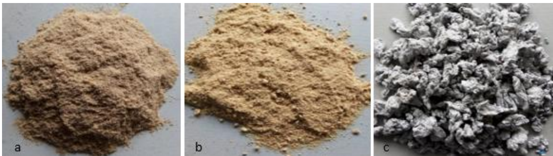
Fig. 1. Dry forms of (a) untreated wood dust (b) treated wood dust (c) waste newspaper pulp

Again, the procedure used by Oladele and Okoro [11] was adopted to assess the percentage water absorption of each sample after immersion in water for 6 hours. All the tests in this work were performed at room temperature. In each case, the mean and standard error values of the results were computed, tabulated and analyzed.