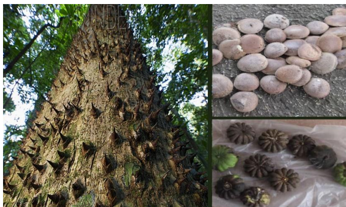
Fig. 1. Hura crepitans : Tree, seeds and fruits

androgenetic alopecia (AGA) [45]. The mechanism by which Hura crepitans exerts the effect of hair growth has not been fully elucidated especially as it concerns NT-4 expression in the hair follicles of mice in which there have been implantation of DHT [45]. The mechanisms and activity of androgen receptor (AR) and NT-4 that is inhibited by Hura crepitans has also not been sufficiently demonstrated. Moreover, the diterpene esters of daphne usually cause irritations of the skin and could act as tumour promoter [46]. Quite recently, Oloyede and others in their quest to drive home the point of the various ethnomedicinal potential benefits of the Hura crepitans plant, isolated some chemical constituents of its stem-bark and went on to show that Hura crepitans could protect against liver induced damages [37]. Daphnane, diterpenes; daphnetoxin acid, huratoxin apocynin and methylpentadecanoate were documented as isolated phytochemicals in their study [37].